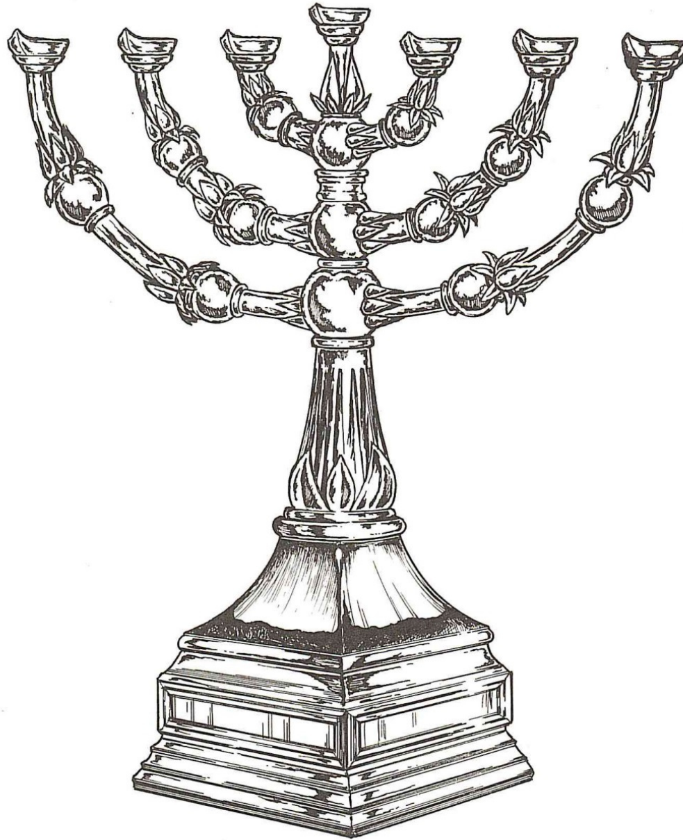
The Golden Lampstand